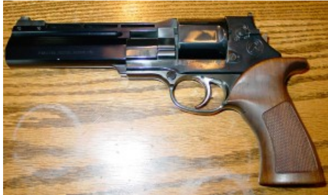
Mataba Model 6

Technically the Macchine Termo-Balistiche Model 6 Unica but known to the world as the Mataba Auto-revolver , this Italian stallion looks so far out there, its only real home has been in a couple dozen of movies. It seems that whenever a director wants a futuristic gun the prop master smiles and pulls out one of these. With its cylinder above the barrel and recoil that cocks the hammer every time, it is an interesting design that collectors seem to love. Today the Mataba's mantle has been picked up by the visually similar Chiappas Rhino and others, so it would seem gun owners today still have a taste for funky revolvers .